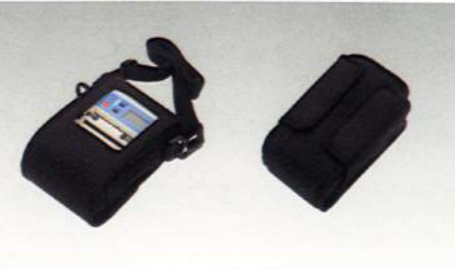
Portable holster (DH-74/75)