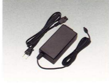
Charger adapter (CV-74/75)