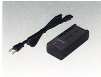
Battery charger (CH-74)