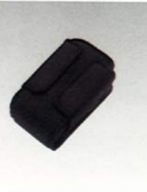
Auxiliary case (HH-74)