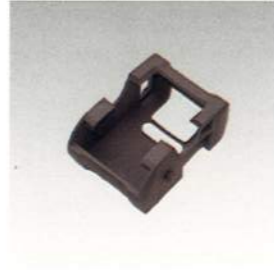
Protector (DP-74) * For DP-2E (Ext. No. L70)