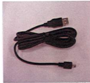
USB Mini-B Cable (F140A)